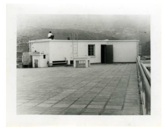
Old Photo (Mill 1 Rooftop of Nan Fung Textiles Limited), 1955