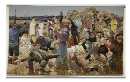
Aziz + Cucher, The Road, 2016 Collection of CHAT, Hong Kong