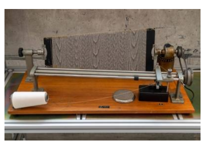
Winding Board (Nan Fung Textiles Limited), 1997, Collection of CHAT, Hong Kong