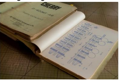
'Cherry' Drawing Frame Manuals (Cherry D-400MT, Japan,

Made by Hara Shokki Seisakusho), 1986, Collection of CHAT, Hong Kong